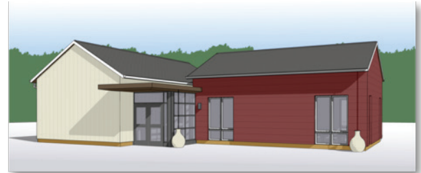
Artist rendering of future Visitor's Center

The new visitor center has a flat roof over the central corridor running through the building. This is an ideal location for a vegetated roof that will provide habitat for birds, reduce the heat island impact of the new building, and reduce the amount of stormwater runoff from the roof. These combined benefits will provide a reduced impact on the historic and environmental setting.